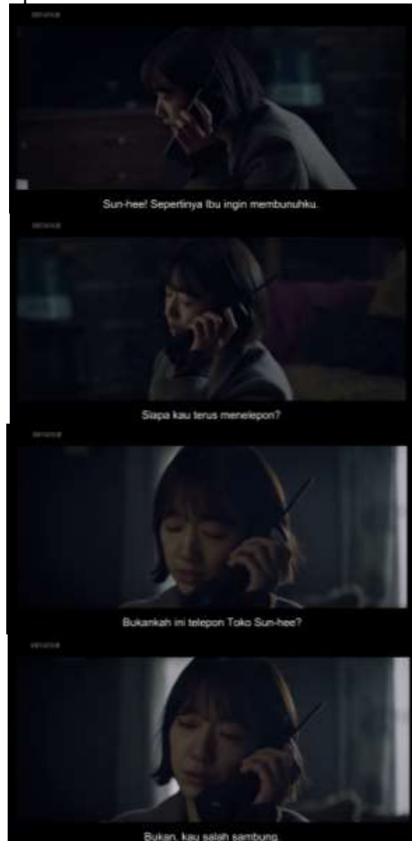
Data 8: When Yong-Sook called his own house

At the beginning of the story, there is a scene where Yong-Sook should have called the Sun-Hee Store number, but instead connected to his own house number in 2019, which was picked up by Seo-Yeon. This is still very confusing and ambiguous, because the exact reason why the call is wrong is not explained.