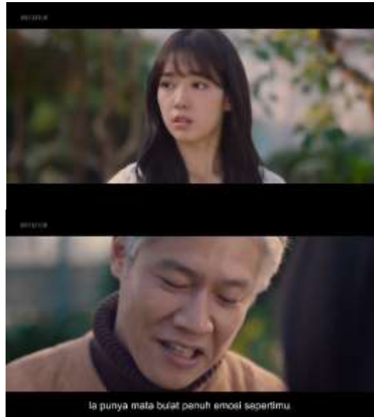
Data 6: Se-Yeon meets her father back in the future

Then, the first reason why this film uses a forward plot is because Seo-Yeon's life after Yong-Sook managed to save her father continues to move forward. This is marked by the appearance of Seo-Yeon's father who is aging and his family continues to live life as usual as if nothing happened.