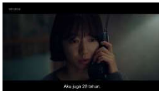
Data 2: Seo-Yeon (2019)

This film uses the concept of time travel indirectly. This is marked by the existence of a telephone that can make calls to the previous decade (10 years ago). The call allowed Yong-Sook who was in 1999 to make calls with Seo-yeon in 2019.