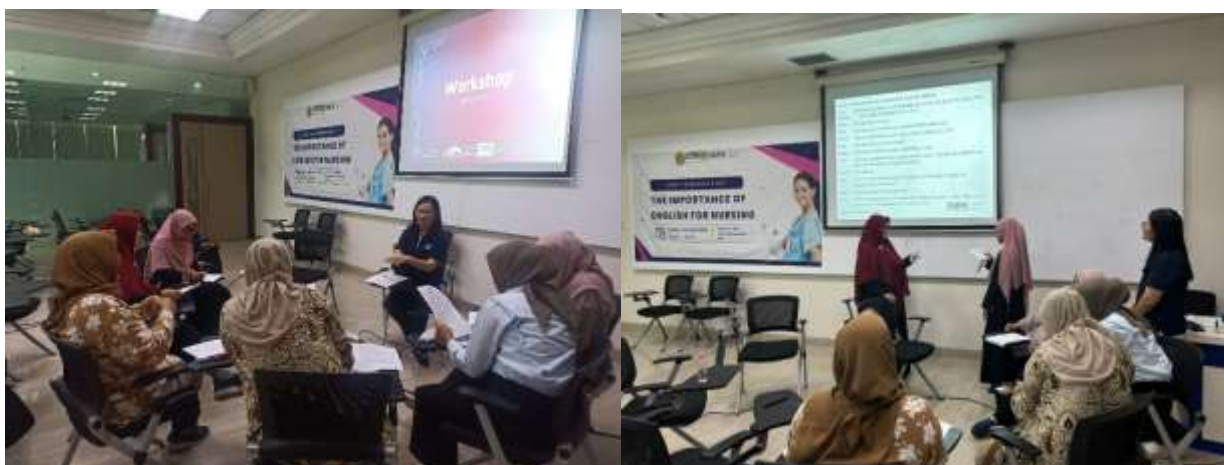
Picture. 3 Workshop and performance session

After the seminar session, the community service proceeded to the workshop, where tutors engaged the students in a conversation about procedural nursing skills and medical terms in vital signs. The sessions were engaging as the participants were taught to recite the conversation and practiced on their own how to give nursing care in English. At the end of the workshop, the participants worked with their peers and performed an English nursing care that they had practiced together. The other participants were asked to comment on the other performances to give feedback. Below is the documentation from the workshop session.