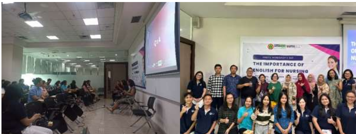
Picture. 2 Seminar Session

Kini” where nurses were given insights regarding the future of English in medical services and how nurses could cope with it. The second session was entitled, “Sharing pentingnya “English for Nursing – Perspektif bekerja di luar dan dalam negeri,” which gave hope to the nurses that even nurses can have international careers. Below are the pictures from the Seminar.