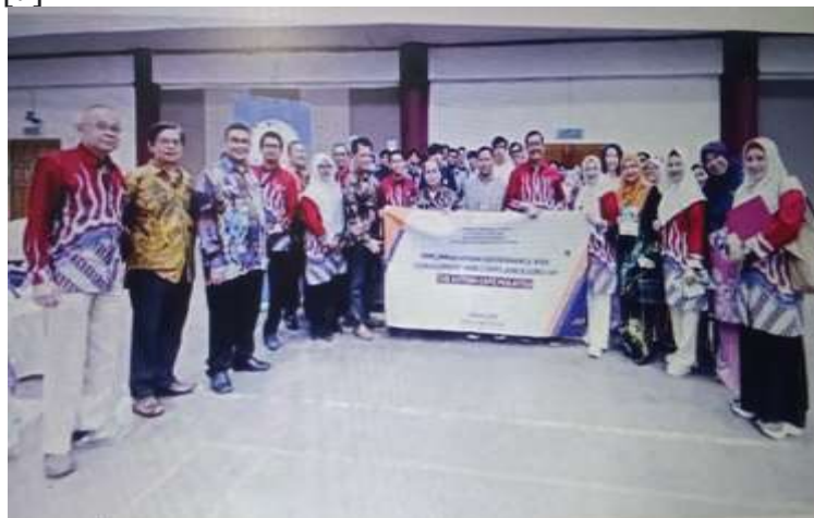
Figure 2. Group Photo of PKM-I Participants from UNPAM, PCA and PSA Polytechnic Malaysia

In line with the signing of the work of the three participants, PCA, PSA Polytechnic Malaysia and UNPAM, PCA also carried out a cooking demonstration which was entirely carried out by autistic sufferers who are members of PCA Malaysia. This activity certainly needs to be appreciated considering that PCA Malaysia has succeeded in enabling autistic sufferers to rediscover their identity as people who can benefit society and their environment. Apart from this, the participants and autistic sufferers from PCA also held a unique exhibition, where on this occasion they displayed their work in the form of various handicrafts, knitting products and various cakes, all of which were purely produced by them. On this occasion, in accordance with the PKM-I theme, the Rector of UNPAM emphasized the importance of the QRIS payment application in Malaysia, considering that Indonesia has proven it for almost 4 years since August 2019 and in 2023, QRIS users in Indonesia are almost 46 million [9].