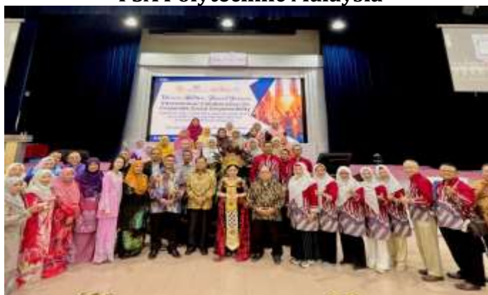
Figure 3. PKM-I Participants from UNPAM and PSA Polytechnic Malaysia