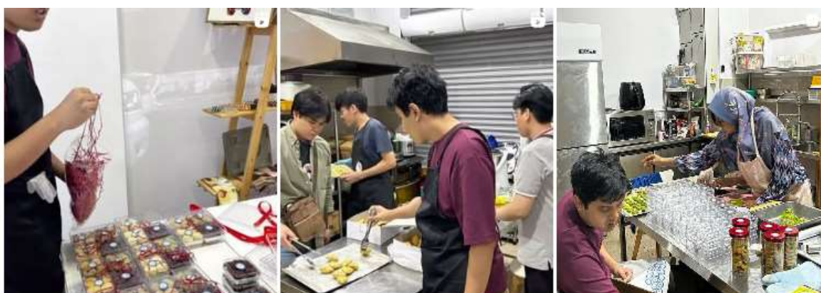
Figure 5. Activities of Autism Café Project (PCA) Malaysia