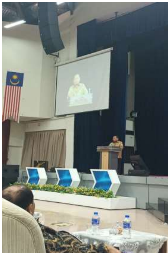
Figure 4. Rector UNPAM Delivered Keynote Speech