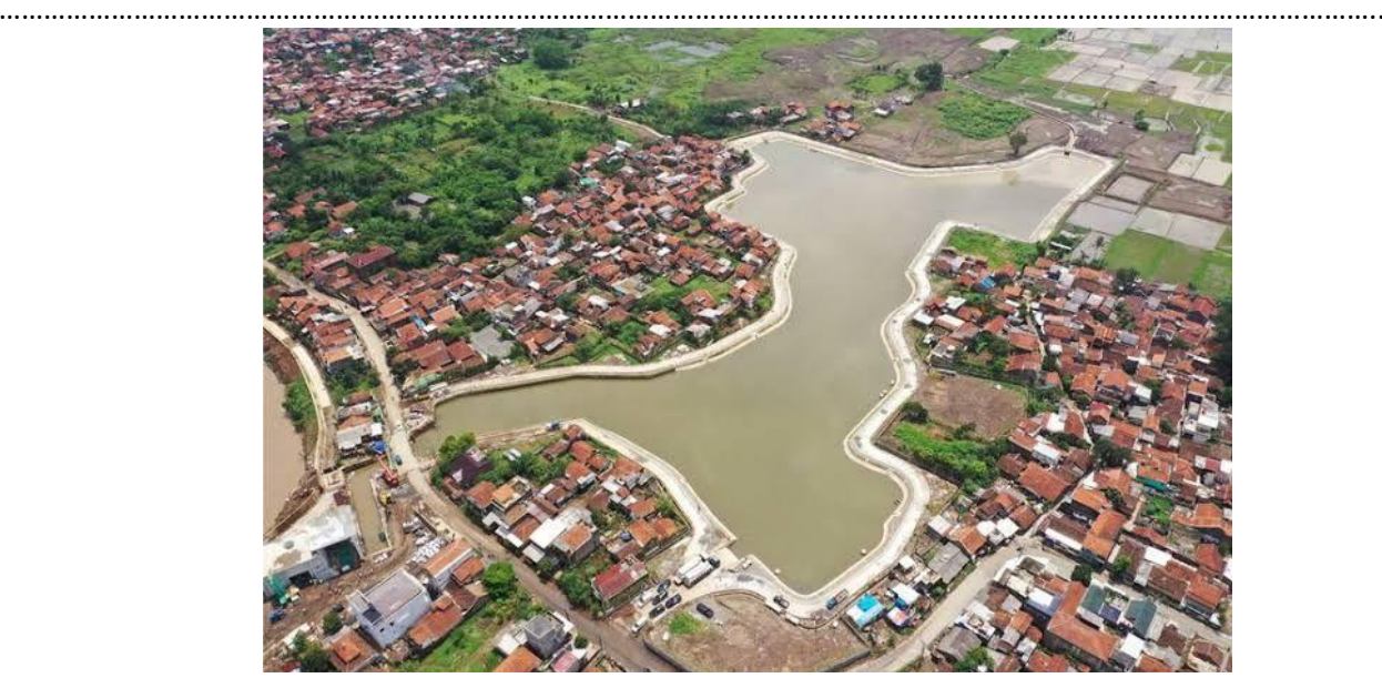
Ficture 5. Flood Control System in Pekanbaru

Crossref DOI: <u>https://doi.org/10.53625/ijss.v3i5.7425</u>