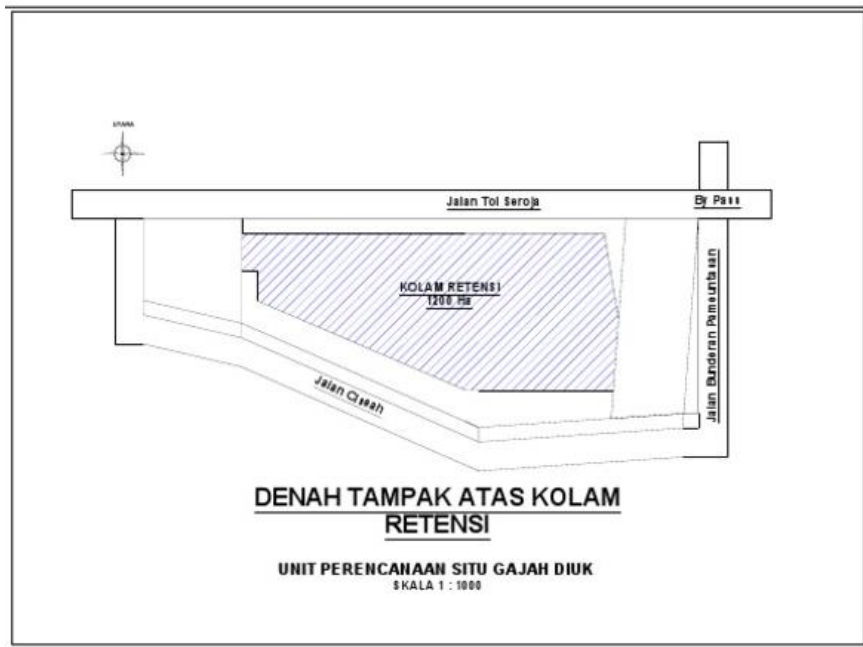
Ficture 1. Retention Pool Plan

In the context of urban management planning, it is important to consider retention ponds as multiple assets. Urban planning that focuses on sustainability and multifunctional use of infrastructure can create a balance between flood control, ecotourism development and water conservation. This strategy can have a wider positive impact and provide added value to local communities.