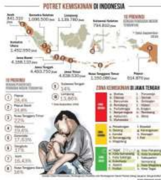
Figure 1 Infographic Distribution of Regions with Extreme Poor Criteria in Indonesia in 2022

Klaten is one of the 19 regencies in Central Java Province that included in the category of extreme poor (Solo Pos, 11 April 2022). This determination carried out by the Central Bureau of Statistics in 2022 as outlined in Klaten In Figures 2021.