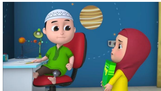
Figure 2. Please and thank you