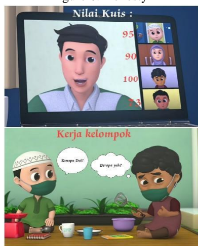
Figure 6. Honesty