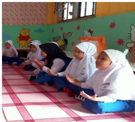
Figure 4. Children pray before studying

Mahdi M Ali (2016) Teaching children to pray from an early age is very affective because the child's brain is still easy to catch and remember things. The benefit of teaching prayer to children from an early age is to get used to praying when they are about to do something. If all parents realize the importance of teaching prayer to their children, this nation will surely become a nation of peace and prosperity. And without us realizing it, applying prayer to children can develop and hone their cognitive abilities and brain abilities.