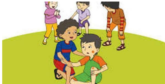
Image 1. Good behavior