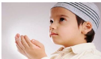
Figure 3. Pray