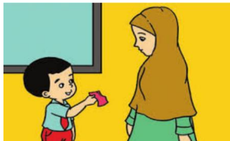
Figure 5. Honesty