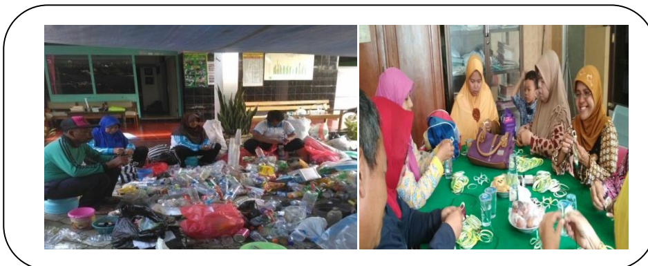
Source: Department of Environmental Sanitary and Landscaping of Kediri City 2018