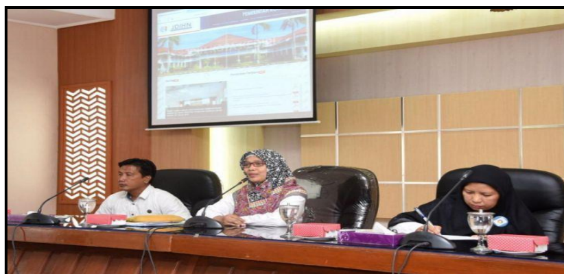
Picture: Mayor socialization Regulation N0 35 2018 on Policies and Strategies of Kediri in Household Waste Management and Waste Household kind in Kediri City Hall. East Java.

Source: Department of Environmental Sanitary and Landscaping of Kediri City 2018