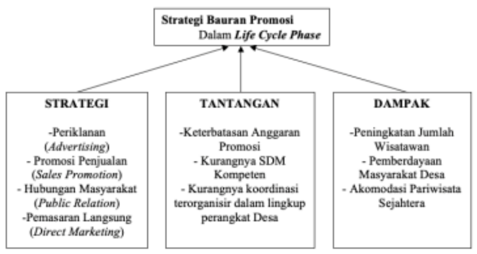
Figure 1. Analysis Explanation Diagram

research the promotional mix strategy is also closely related to the concept Tourism Area Life Cycle (TALC) developed by Butler (1980).