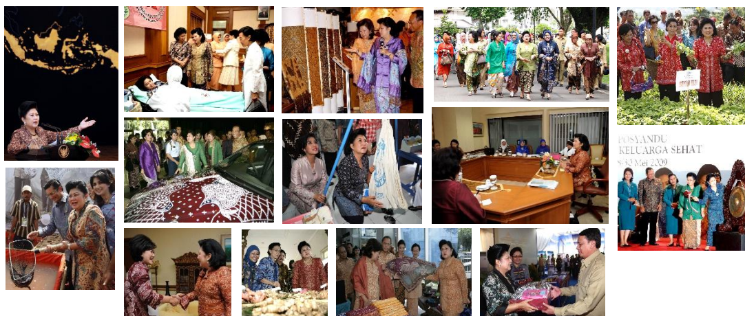
Figure 3: Photos that are categorized based on the meaning of the relationship between the First Lady and the bureaucrats [13]

Then second, here are the photos (figure 3) that are categorized based on the meaning of the relationship between the First Lady and the bureaucrats.