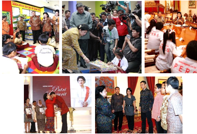
Figure 4: Photos that are categorized based on the meaning of the relationship between the First Lady and her family [13]

From the photos in figure 4, it can be concluded that (1) Ani's influence was seen when accompanying President SBY to carry out state activities. Ani looks more dominant in each activity. In terms of criticizing, giving input, or fostering children, while President SBY looks more quiet, observant, and wise. (2) On the relationship between mother and child, Ani and her eldest son Agus Harimurti Yudhoyono. Even though Agus is an Infantry Captain, he still respects and obeys Ani's orders. What Ani advised became a mandate for Agus as a devoted child. (3) The maternal instinct is seen when Ani hosts and welcomes the arrival of relatives from her child. Ani gives advice to them like a mother to her own child. Ani also gave the same treatment to Agus, Ani's eldest son. Fourth, the following are photos categorized based on the meaning of the relationship between the First Lady and the Indonesian people.