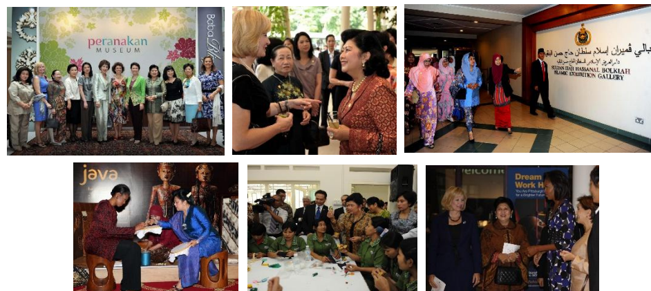
Figure 2. Photos that are categorized based on the meaning of the relationship between Indonesia and other countries [13]

Then second, here are the photos (figure 3) that are categorized based on the meaning of the relationship between the First Lady and the bureaucrats.