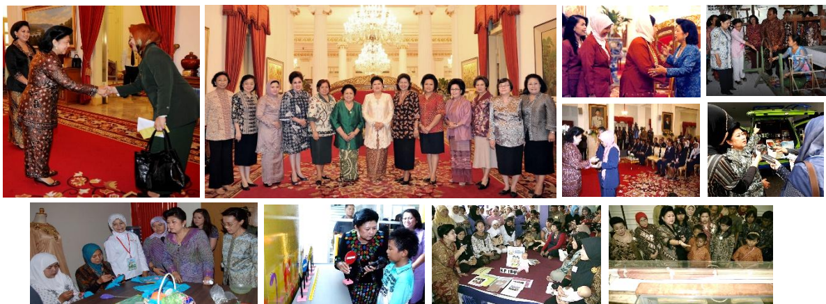
Figure 5: Photos that are categorized based on the meaning of the relationship between the First Lady with the Indonesian people [13]